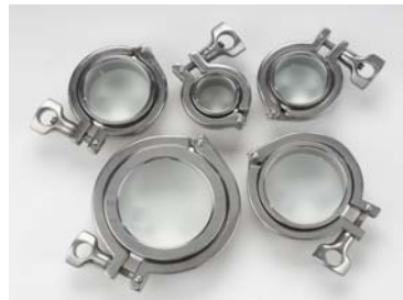
Shown with optional clamp.

In the interests of development and improvement of the product, we reserve the right to change the specifications without prior notice.